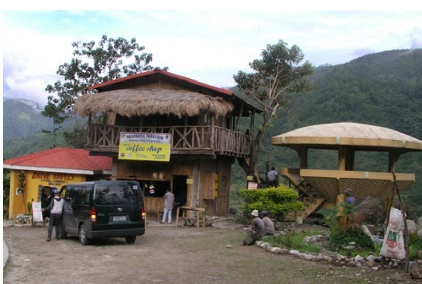
PANORAMA VIEWPOINT SABANGAN, MT. PROVINCE